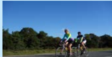
Photo right: The Gridiron 100